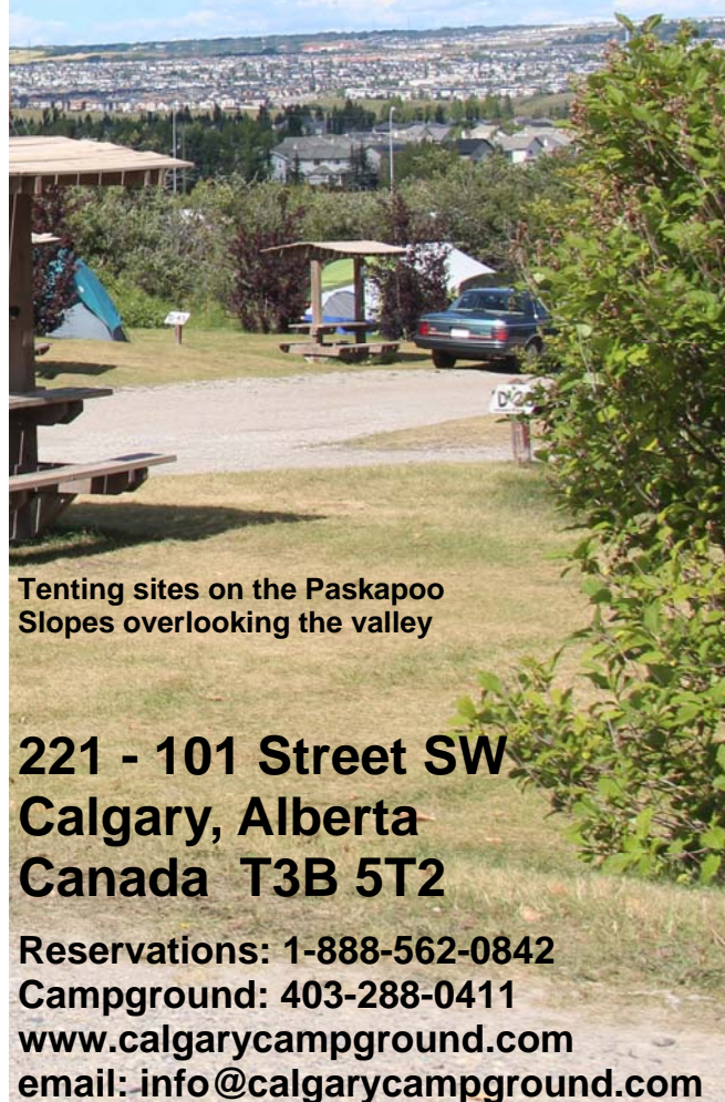
Tenting sites on the Paskapoo Slopes overlooking the valley

Enjoy our famous western hospitality Country setting within the city