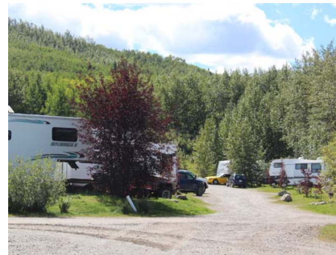
ENJOY OUR PICTURESQUE SETTING ON THE PASKAPOO SLOPES

Calgary's first known history is the Paskapoo Slopes which dates back at least 3,000 years, to the days when nomadic aboriginal tribes would use the Slopes as a camp to spend their winters.