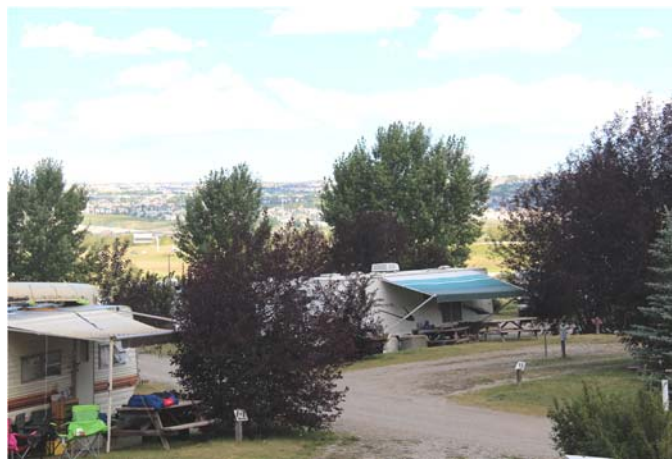
ROLLING HILLSIDE WITH TERRACED SITES, VALLEY VIEW AND FULL HOOKUPS